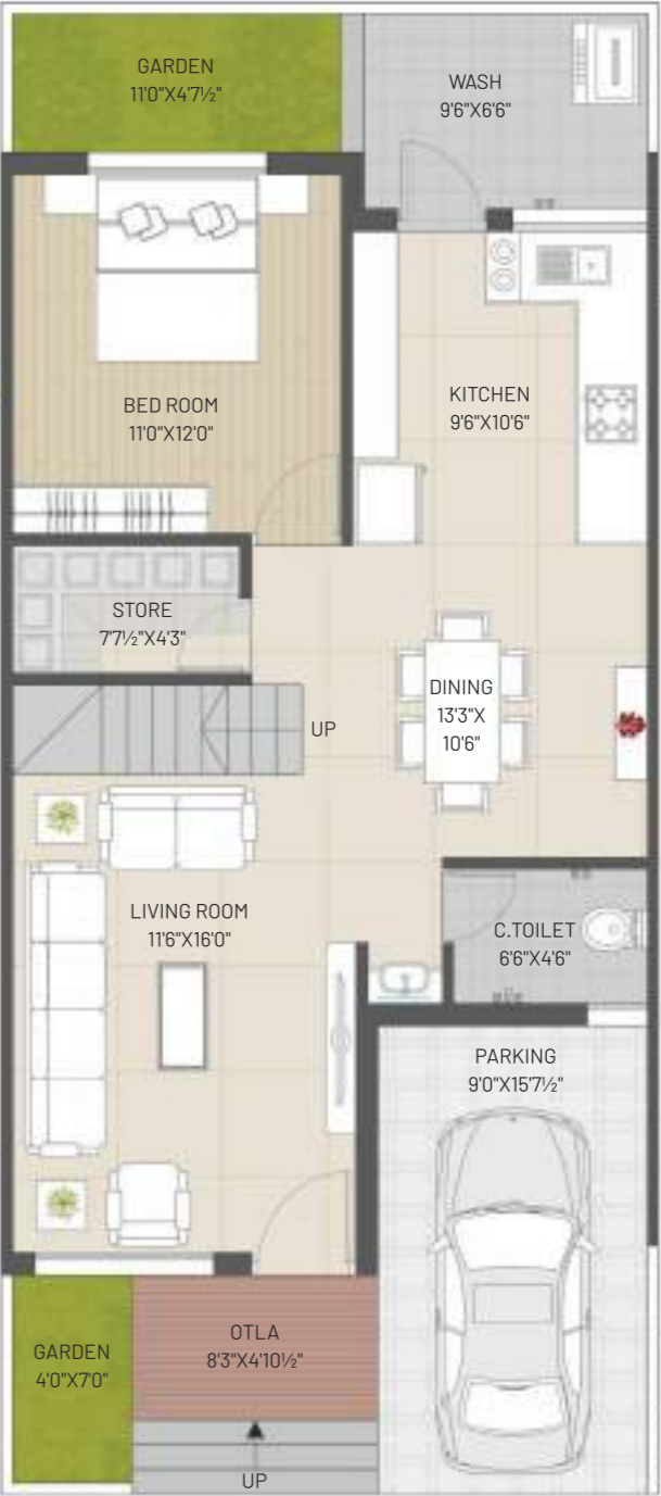
GROUND FLOOR PLAN ◆◆◆